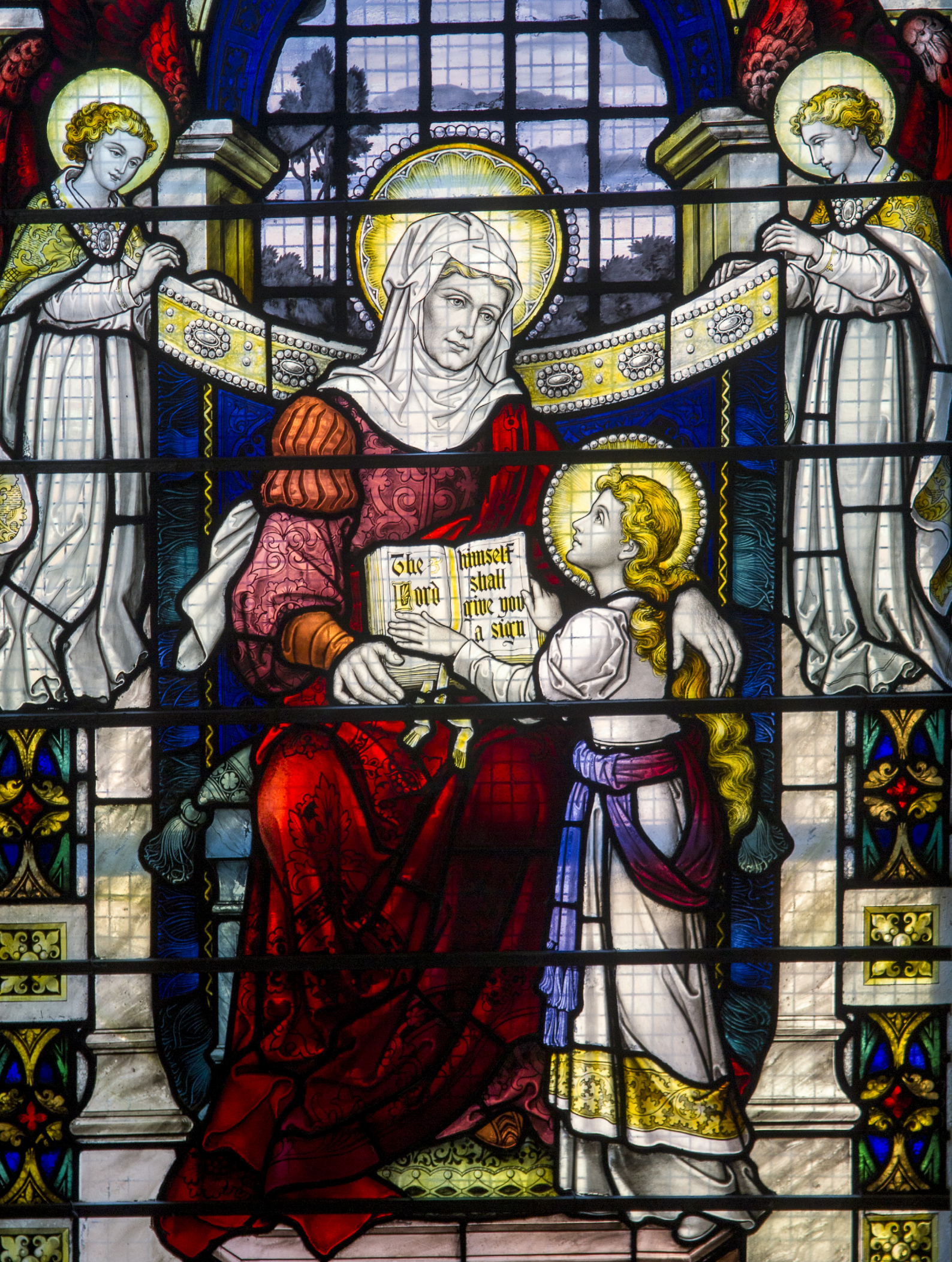
Stained glass window depicting St Anne with Mary in St Anne's Catholic School Performing Arts Centre.